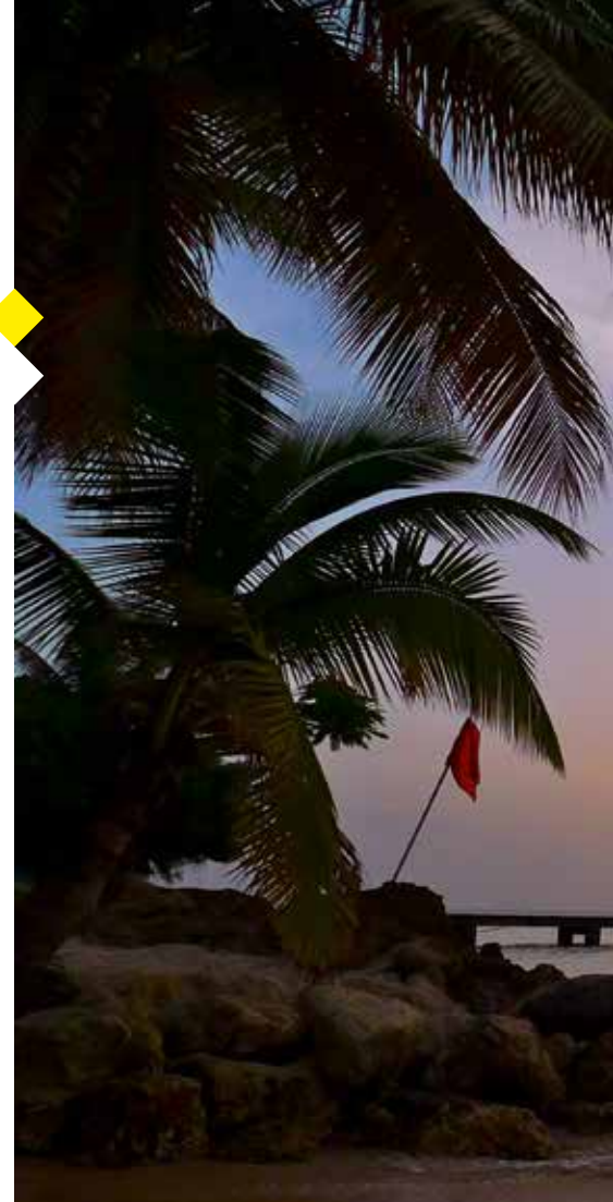
CLOCKWISE: Be sure to catch the sunset at one of Tobago's famously wild Caribbean beaches; marvel at the tropical shades of Africa's sprawling, stunning Lake Malawi; and Sintra in Portugal is renowned for its superior surf breaks and crashing waves